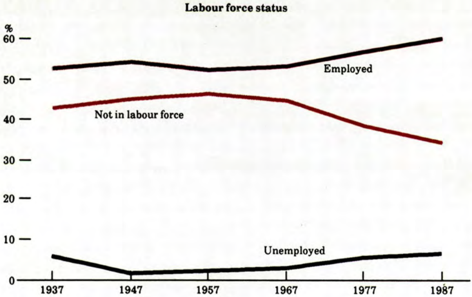
Chart 5.3 Selected labour force characteristics